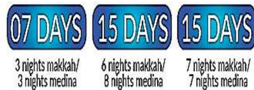
Figure 6. Secondary Announcement

premodification, head and postmodification (Bloor & Bloor, 2007).