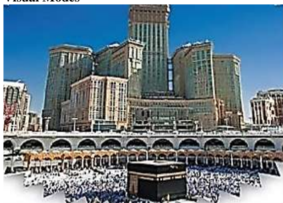
Figure 2. Lead (Locus of Attention)

The Lead element in figure 2 contains a visual image of al-Haram Mosque as the iconic and most prominent part in the advertisement. This visual presentation can be understood as a persuasive strategy from the advertising producer to lead readers to understand the message. In the picture, it is clear that the profile of the Mosque which includes the Kaaba, the small shrine located near the center of the Mosque, and the people around it is the Locus of Attention (LoA). The representational meaning is related to conceptual process as it is indicated by the images that do not contain vectors, are stable, and emphasize more on the description of the represented participants and the meaning relation between them (Kress & van Leeuwen, 2006).