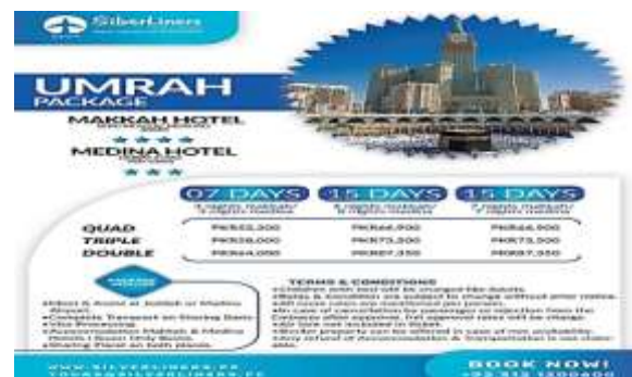
Figure 1. Umrah Pilgrimage Advertisement

This study employed a qualitative approach in the framework of multimodal analysis of the Umrah pilgrimage advertisement. The data in this study are verbal and nonverbal texts contained in the advertisement. Verbal text components are words, phrases, and clauses, while visual text components are pictures and colors. The data were taken from the Umrah pilgrimage advertisement downloaded from the Silver liners website at www.silverliners.pk . Data analysis was carried out in an eclectic method by applying the theories of Generic Structure of Advertisement (Cheong, 2004), Systemic Functional Grammar (Halliday, 2004; Halliday & Matthiessen, 2014), Visual Grammar (Kress & van Leeuwen, 2006), and Intersemiotic Complementarity (Royce, 2007).