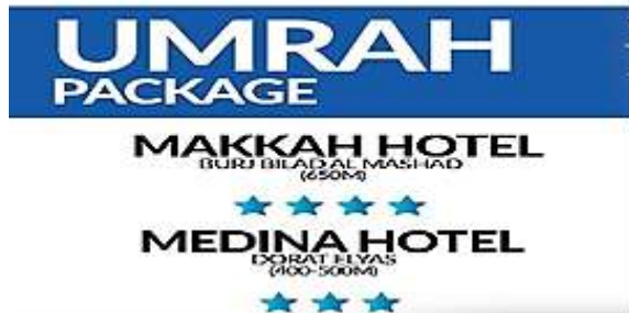
Figure 5. Primary Announcement

In the Umrah pilgrimage advertisement, a verbal construction is found in figure 5 which is identified as the Primary Announcement. The thing that marks it is the use of capital letters in large sizes and contrasts with the background color as the catchphrase that is the core of the advertisement (Cheong, 2004). These lexical items are categorized as nominal groups, namely a collection of words with nouns as the main elements (Fontaine, 2013). From this section, three nominal groups were found, namely UMRAH PACKAGE, MAKKAH HOTEL BURJ BILAD AL MASHAD (650 M), and MEDINA HOTEL DORAT EKYAS (400-500 M).