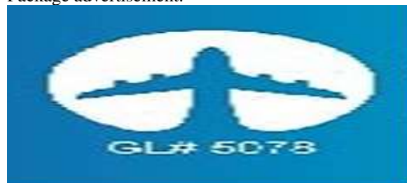
Figure 4. Visual Emblem

In terms of compositional meaning, the hotel image is located at the top of the advertisement which can ideally be interpreted as general information about hotel facilities in the Umrah Package advertisement. The information is then detailed again by the lexical items below it as a real explanation. The purpose of the presentation of images and lexical items is to provide communicative and cohesive information about Umrah Package advertisements. Visuals containing pictures of the hotel complement the existence of the main objects, namely al-Haram Mosque, the Kaaba, the pilgrims surrounding the Kaaba, making it easier for viewers to understand the overall meaning of the Umrah Package advertisement.