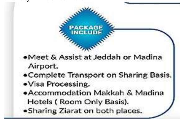
Figure 7. Enhancer

The next element is the Secondary Announcement as shown in figure 6. The element is a nominal group written in a letter size smaller than the Primary Announcement and contains the use of lower case. The information in the Secondary Announcement serves to support the Main Announcement. As a supporting component, secondary announcements also contain textual metafunctions that are described in the determination system to mark the cohesiveness between elements in the nominal group. The focus of this section is the nominal group 07 DAYS, 3 NIGHTS MAKKAH/3 NIGHTS MEDINA, 15 DAYS 6 NIGHTS MAKKAH /8 NIGHTS MEDINA, 15 DAYS 7 NIGHTS MAKKAH/7 NIGHTS MEDINA. For example, this can be seen in the determination system 7 days 3 nights Makkah 3 nights Medina which consists of the Numerative function 7 which shows the number of days with 3 nights in Makkah and 3 nights in Medina. The cohesion between nominal group elements is indicated by the compatibility between numerative and Head/thing in plural which is indicated by the plural suffix -s. The message conveyed is the duration of the Umrah Package offered, for example 7 days with 3 nights in Makkah and 3 nights in Medina. With the use of this determiner, the nominal group structure becomes cohesive so that it supports and completes the meaning of the Umrah Package as offered in the Primary Announcement.