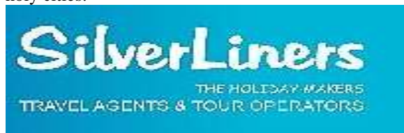
Figure 8. Verbal Emblem

an image of the al-Haram Mosque as a place of Umrah worship. In addition to providing information about the benefits of the Umrah Package, the information in the enhancer tries to convince readers of the benefits of using the services and facilities of this company, such as guides at the Jeddah or Medina airports, complete transportation during Umrah, visa processing, hotel accommodation while in Makkah and Medina, and also pilgrimage package in the two holy cities.