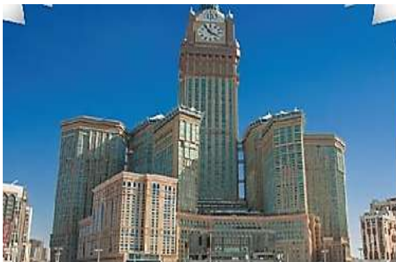
Figure 3. Lead (Complement of LoA)

The visual placement of Umrah Package as the title of the advertisement and the LoA image of the al-Haram Mosque at the top of the advertisement is considered ideal because it is still general information. Meanwhile, a series of displays containing lexical items lower than LoA are more realistic because they contain information about the Umrah Package in more detail. The most prominent and dominant thing is the visual that contains the lexical item Umrah Package written in upper case and placed in the middle as a catch-phrase in the advertisement, which is juxtaposed with the image of the al-Haram Mosque as a place for Umrah worship to take place. The display of white letters contrasted with a blue background adds a salience aspect that reinforces meaning and becomes the core of the advertising message.