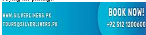
Figure 10. Call-and-Visit Information

The Tag section in figure 9 provides information about the terms and conditions available in the Umrah Package advertisement. This relates to service operational procedures, which were not previously stated in the enhancer. Information in non-obtrusive tag is indicated by the lower case print. This indicates that the enhancer element plays a role in completing the Umrah package information contained in the Primary Announcement. The contents are about technical matters and rules that must be obeyed by prospective consumers when buying the package.