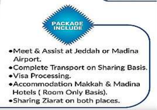
Figure 7. Enhancer

The next element is the Secondary Announcement as shown in figure 6. The element is a nominal group written in a letter size smaller than the Primary Announcement and contains the use of lower The information in the Secondary Announcement serves to support the Main Announcement. As a supporting secondary announcements also contain textual metafunctions that are described in the determination system to mark the cohesiveness between elements in the nominal group. The focus of this section is the nominal group 07 DAYS, 3 NIGHTS MAKKAH/3 NIGHTS MEDINA, 15 DAYS 6 NIGHTS MAKKAH /8 NIGHTS MEDINA, 15 DAYS 7 NIGHTS MAKKAH/7 NIGHTS MEDINA. For example, this can be seen in the determination system 7 days 3 nights Makkah 3 nights Medina which consists of the Numerative function 7 which shows the number of days with 3 nights in Makkah and 3 nights in Medina. The cohesion between nominal group elements is indicated by the compatibility between numerative and Head/thing in plural which is indicated by the plural suffix -s. The message conveyed is the duration of the Umrah Package offered, for example 7 days with 3 nights in Makkah and 3 nights in Medina. With the use of this determiner, the nominal group structure becomes cohesive so that it supports and completes the meaning of the Umrah Package as offered in the Primary Announcement.