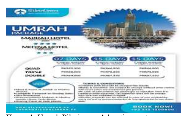
Figure 1. Umrah Pilgrimage Advertisement

This study employed a qualitative approach in the framework of multimodal analysis of the Umrah pilgrimage advertisement. The data in this study are verbal and nonverbal texts contained in the advertisement. Verbal text components are words, phrases, and clauses, while visual text components are pictures and colors. The data were taken from the Umrah pilgrimage advertisement downloaded from the Silver liners website at www.silverliners.pk. Data analysis was carried out in an eclectic method by applying the theories of Generic Structure of Advertisement (Cheong, 2004), Systemic Functional Grammar (Halliday, 2004; Halliday & Matthiessen, 2014), Visual Grammar (Kress & van Leeuwen, 2006), and Intersemiotic Complementarity (Royce, 2007).