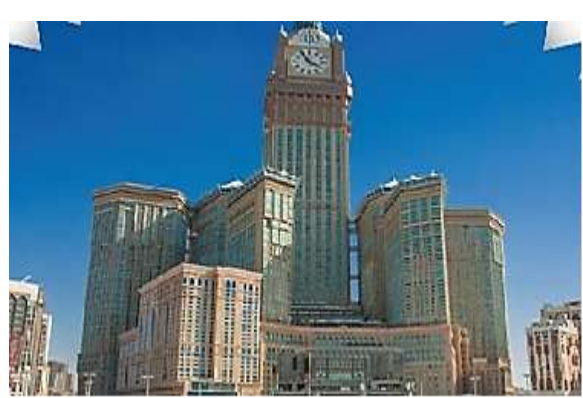
Figure 3. Lead (Comploment of LoA)

The visual placement of Umrah Package as the title of the advertisement and the LoA image of the al-Haram Mosque at the top of the advertisement is considered ideal because it is still general information. Meanwhile, a series of displays containing lexical items lower than LoA are more realistic because they contain information about the Umrah Package in more detail. The most prominent and dominant thing is the visual that contains the lexical item Umrah Package written in upper case and placed in the middle as a catch-phrase in the advertisement, which is juxtaposed with the image of the al-Haram Mosque as a place for Umrah worship to take place. The display of white letters contrasted with a blue background adds a salience aspect that reinforces meaning and becomes the core of the advertising message.