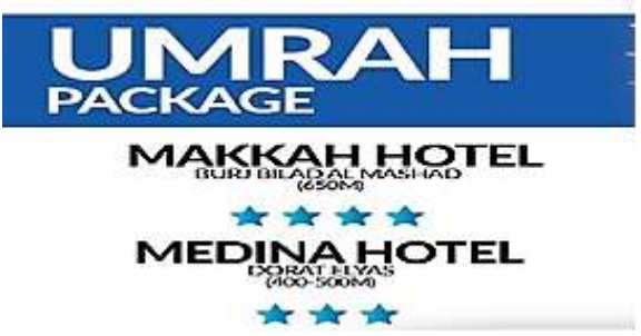
Figure 5. Primary Announcement

In the Umrah pilgrimage advertisement, a verbal construction is found in figure 5 which is identified as the Primary Announcement. The thing that marks it is the use of capital letters in large sizes and contrasts with the background color as the catchphrase that is the core of the advertisement (Cheong, 2004). These lexical items are categorized as nominal groups, namely a collection of words with nouns as the main elements (Fontaine, 2013). From this section, three nominal groups were found, namely UMRAH PACKAGE, MAKKAH HOTEL BURJ BILAD AL MASHAD (650 M), and MEDINA HOTEL DORAT EKYAS (400-500 M).