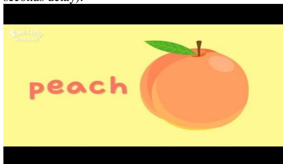
Fig 2 English educational video – kids vocabulary

Then the researcher directed Ananda to listen to an educational video about fruits vocabulary. The educational video was obtained from the "English SingSing" YouTube channel entitled "Kids Vocabulary – Fruits & Vegetables". In the video, Ananda is directed to listen to the pictures of the fruit, the written form and the sound of the word first. Then in the "Review" section, Ananda is invited to repeat the words mentioned in the video (after 2 seconds delay).