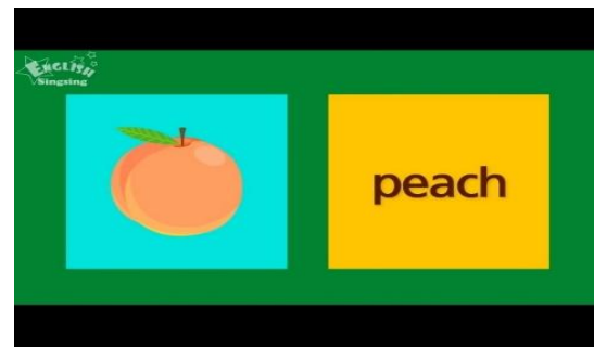
Fig 3 English educational video – kids vocabulary

At the end of the learning activity, the researcher gave reinforcement again by inviting Ananda to mention the names of the fruits that had been studied. As a result, from the 10 fruit names learned, 7 fruit names could be repeated well by Ananda, while 3 fruit names still needed scaffolding in the form of citing examples by the researcher. Researchers also do reflection after the learning activities are completed. The results of Ananda's achievements in the first cycle are shown in table 2.