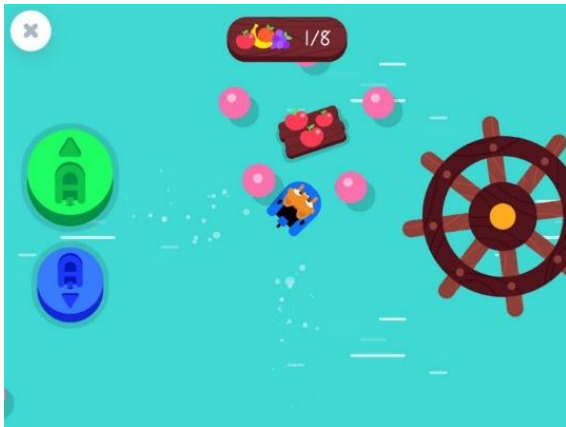
Fig 7 boat navigation game: fruits