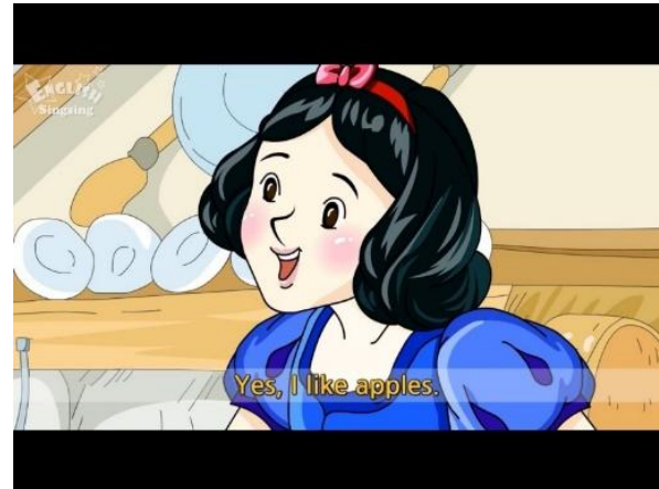
Fig 5 simple story speaking video

of 2 nd cycle, Ananda still needed help from researcher to remember some parts of story but at 3 rd encounter, Ananda did remember the whole story by his own.