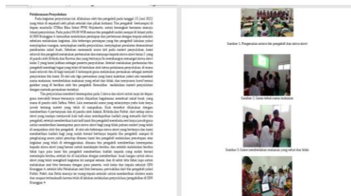
Figure 3. Implementation section activity devotion Public