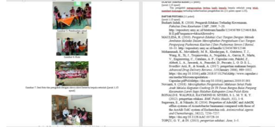
Figure 4. Preparation of the reference list A. Analysis Planning Project Based Learning Method in Learning Indonesian class D S-1 Science Study Program Nursing Mojokerto PPNI Healthy Development Stick

Implemented planning cover formulation Plan Semester Learning (RPS) which includes consist from destination learning, method learning, learning media and others. If planning this arranged with good so created clear guidelines in the learning process so that could with easy reach destination learning that has been determined. As for analysis about planning application project based learning method in learning Indonesian Class D Class 2021 S -1 Science Study Program Nursing Healthy Development Stikes PPNI Mojokerto lecturer has doing with good. At stage this lecturer has formulate and prepare RPS effectively ripe so that application method project based learning is expected to be obtained walk good in accordance with goals that have been planned.